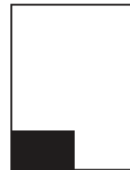
BUSINESS CARD 3.5" X 2.5"