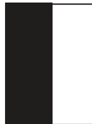
HALF PAGE - V 3.5" X 10"