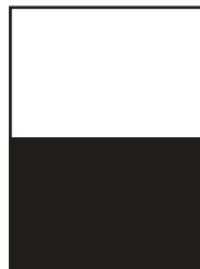
HALF PAGE-H 7.5" X 5"