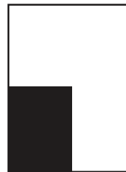
QUARTER PAGE 3.5" X 5"